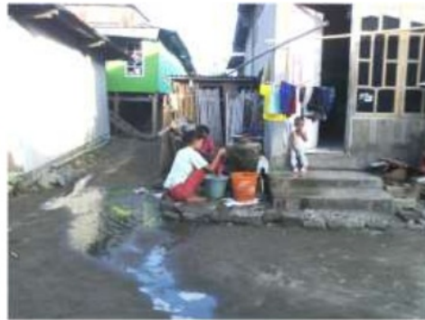
Figure 5. Mutual Assistance between daughter dan mother in semi private wells

Left figure a group of teenagers was taking water at public taps, the distance between teens close to each other. The young women are in a small group of 4 people have an almost same age. The right figure, a condition of public toilets was deserted during the day.