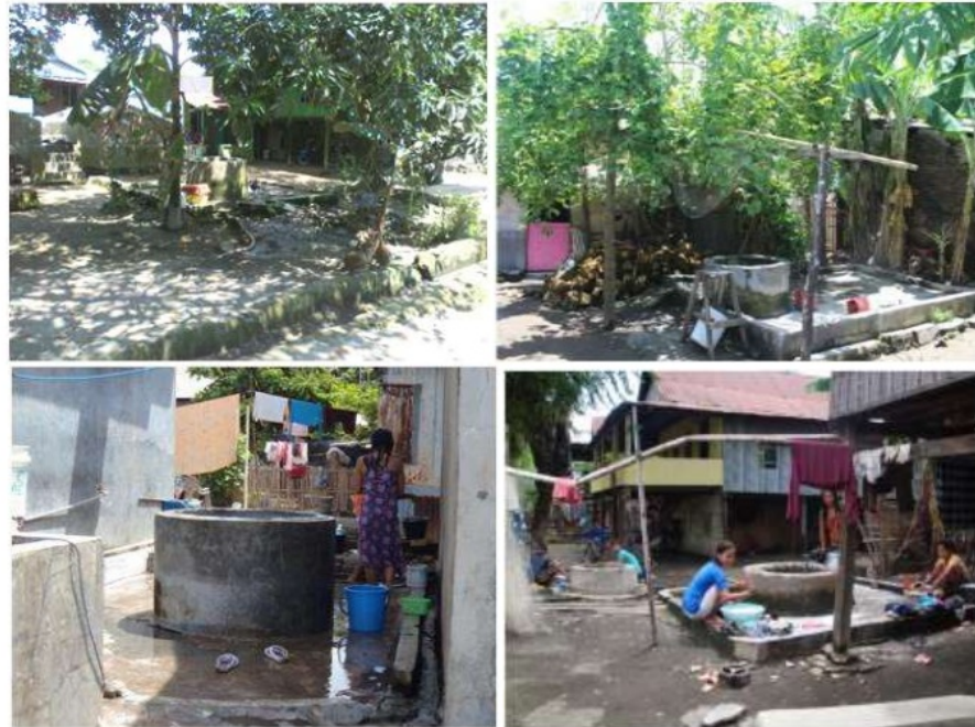
Figure 3. Public wells

At certain hours, public wells are visited by citizens, particularly women. The arrival of women in these places, especially in the morning and afternoon. In the early morning hours, that is between 800 to 1000 hours, when the children had gone to school. The frequency of use is highest in the morning than in the afternoon. Washing clothes is an activity that most frequently used compared to other activity. These activities are carried out jointly, while other needs such as urinating, defecating, and bathing are done individually and sometimes limited by room. At the time of washing that occurs active communication between them, they are often also disputing in the well general. Ablutions are done by men in public wells, before the midday prayer, Asr, and Maghrib. Ablution almost never does in public restrooms or public taps. The following picture shows the situation and conditions in clean water facilities Galesong fishing settlement.