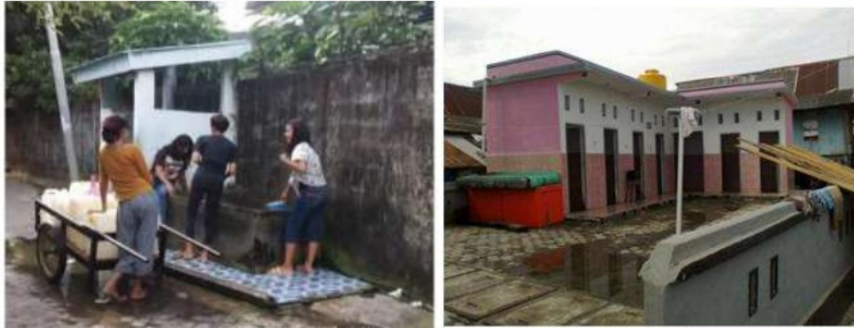
Figure 4. Public taps and public toilets (public toilets)

Left figure a group of teenagers was taking water at public taps, the distance between teens close to each other. The young women are in a small group of 4 people have an almost same age. The right figure, a condition of public toilets was deserted during the day.