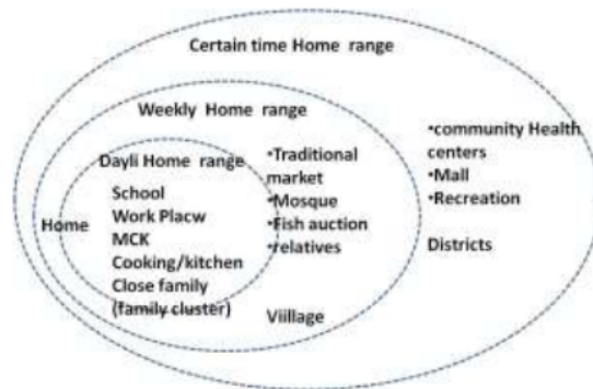
Figure 7. The movement of the population based on fishermen's routines

Separation by age group shows that adult women, the elderly, children and young women are still in the zone nearest the house in activities.